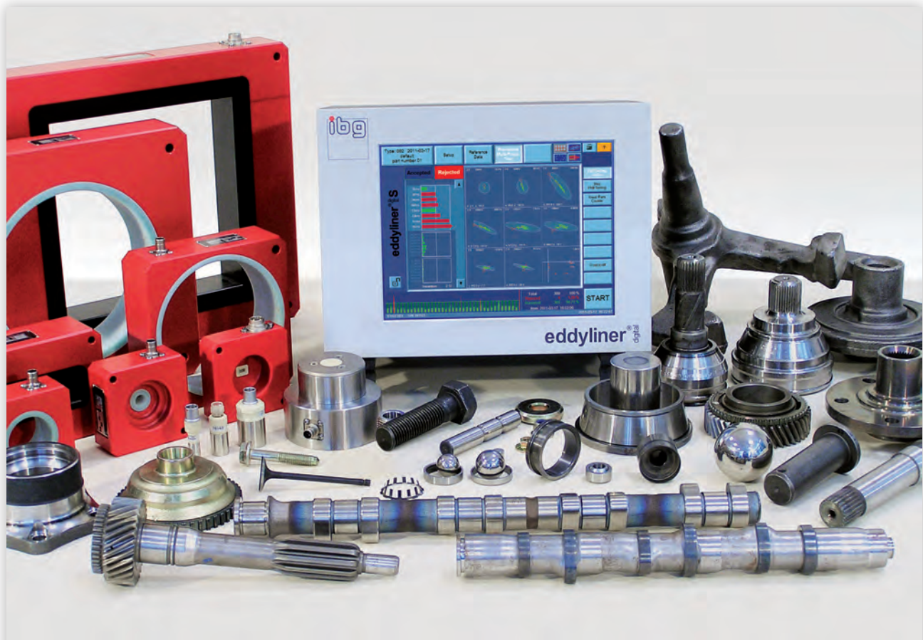
Selection of components - applications solved by ibg technology

The eddyliner digital S distinguishes itself with compact design and concentration on one channel structure applications with one coil at one location combining that with the well-known ibg test reliability and ease of operation. The ergonomic interface facilitates intuitive and simple operation via touch screen. All functions and test results are captured at a glance.