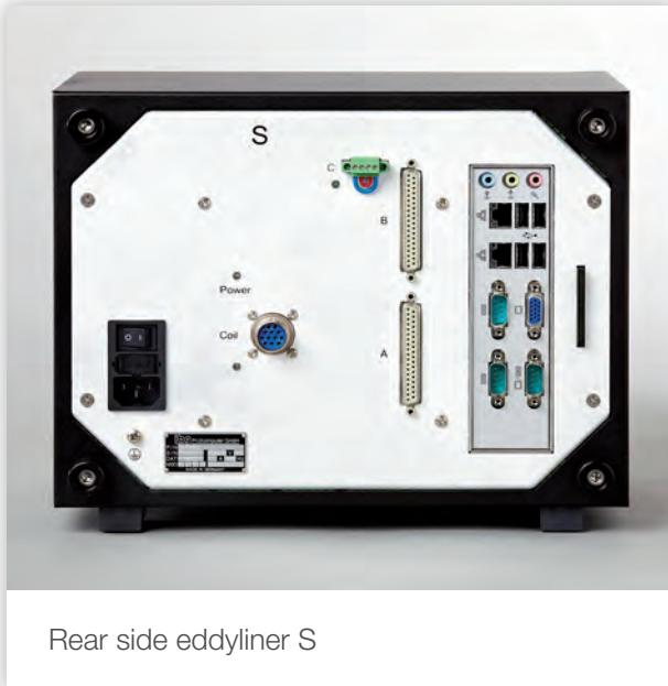
Rear side eddyliner S