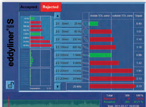
Bargraph display of the test result