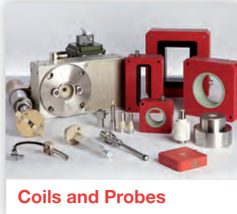
Coils and Probes